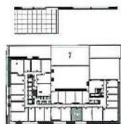
FLOOR 17 575 Sq.Ft. Balcony: 41 Sq.Ft.