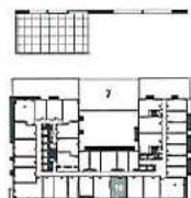
FLOOR 9 575 Sq.Ft. Balcony: 41 Sq.Ft.