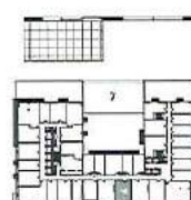
FLOORS 11, 12, 14, 15 575 Sq.Ft. Balcony: 41 Sq.Ft.