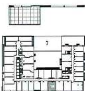
FLOOR 8 575 Sq.Ft. Terrace: 39 Sq.Ft.