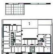
FLOOR 16 575 Sq.Ft. Balcony: 41 Sq.Ft.